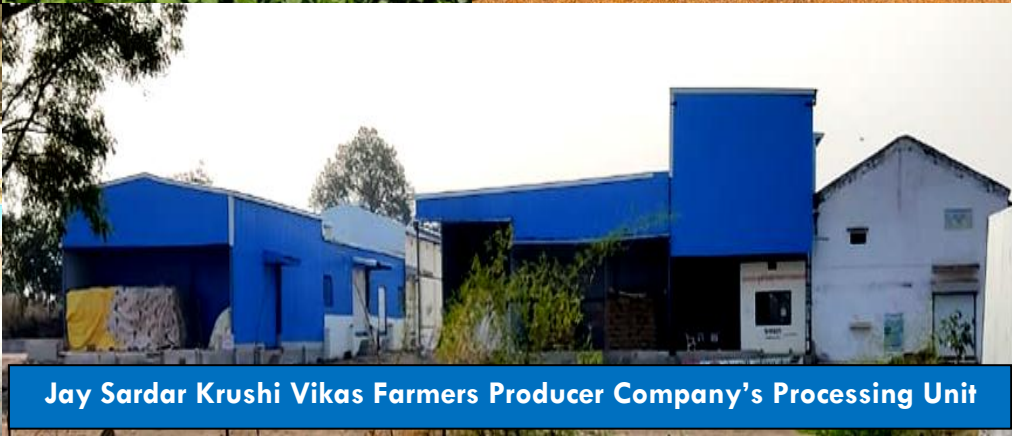
Jay Sardar Krushi Vikas Farmers Producer Company's Processing Unit