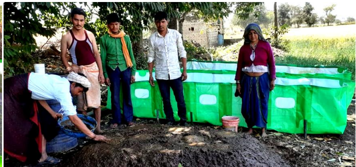
Farmers making Vermicompost