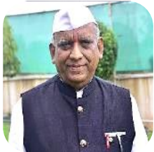
Founder & Chairman

We appeal to all conscious minds to come forward and become a part of the meaningful journey that Krushi Vikas is leading and facilitate impactful changes through collective synergies and hence move towards attaining the mandated sustainable development goals.