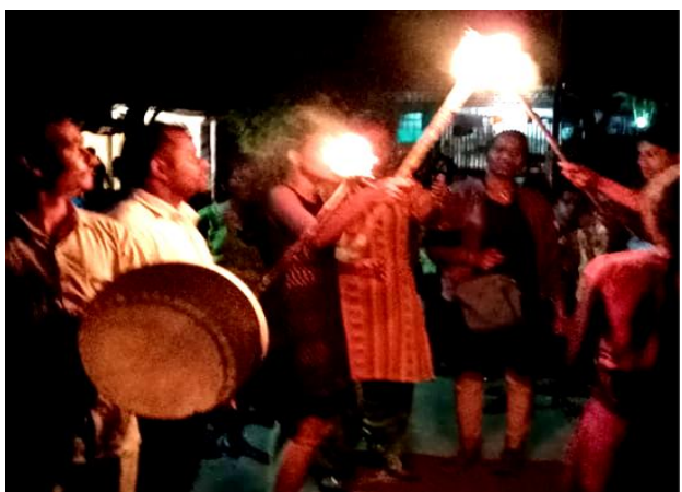
Mashal feri for awareness generation