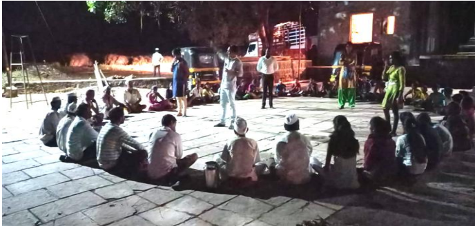
Sensitization through drama

Information, Education and Communication is an integral part of any program/project and are powerful tools to facilitate positive social change among the intended participants group. The IEC tools create awareness, disseminate knowledge and thus act as a stimulus for change in thought processes and behavior change. During the year, Krushi Vikas organized awareness rallies, wall paintings, video shows, conducted webinars and also started an agri-information center for agriculture and allied activities and a counseling centre for students, parents and teachers.