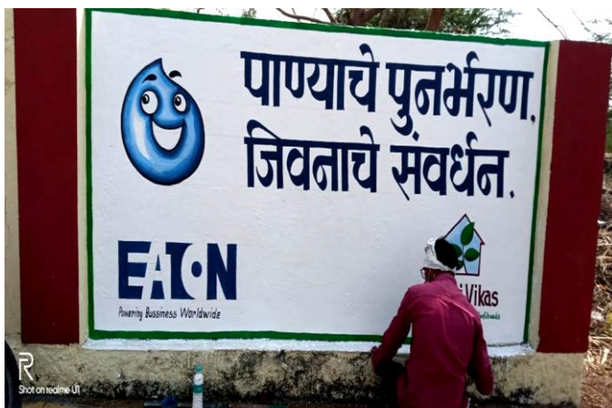
Awareness generation through wall paintings