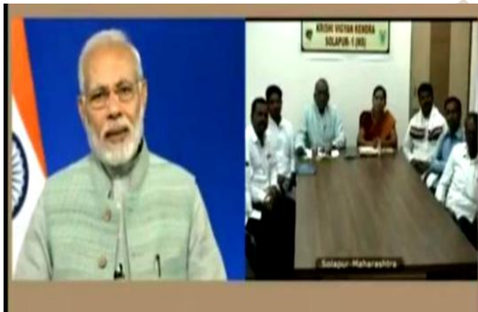
Interaction of Hon'ble PM with Jay Sardar FPC Team

Aggregation and collectivization of small and marginal farmers/producers into groups and new generation cooperatives called Farmer Producer Companies (FPOs) has been touted as the key to addressing agricultural challenges of India. Krushi Vikas nurtured and promoted 55+ FPOs and 15 women led FPOs who are gradually progressing towards sustainability. Jay Sardar FPO promoted by Krushi Vikas has been recognized as a model FPO by the Govt. of India and Hon'ble PM acclaimed Krushi Vikas's efforts by highlighting in 'Mann ki Baat' program on three occasions . Owing to its credibility, Krushi Vikas has been selected as one of the implementing agencies (CBBO) in the 10,000 FPOs formation and promotion scheme of the Govt. of India. In addition, it has also been selected as one of the technical agencies for Scheme of Fund for Regeneration of Traditional Industries (SFURTI) scheme of TRIFED (The Tribal Cooperative Marketing Development Federation of India).