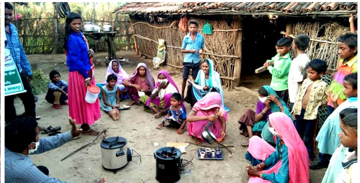
Demo on low cost smokeless chulha