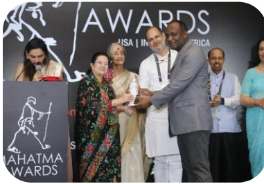
Mahatma Award by Liveweek Business 2019