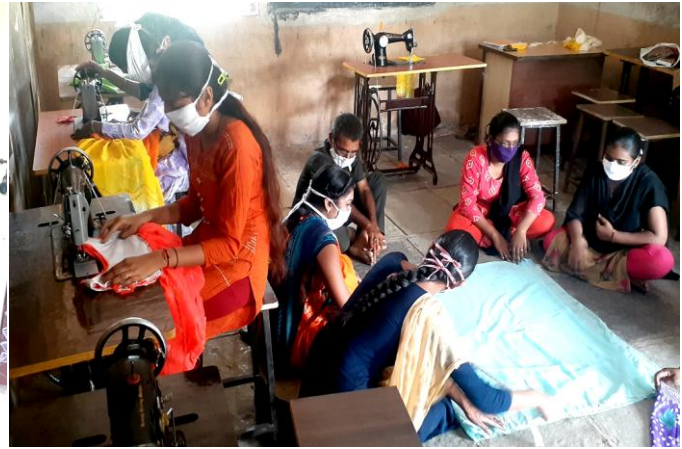
Stitching as a livelihood activity