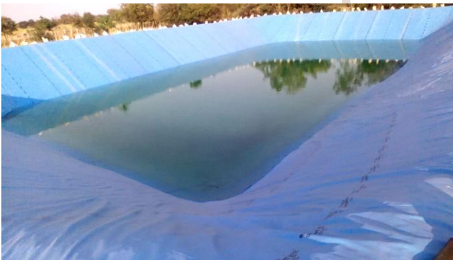
Farm Pond with HDPE liner