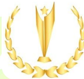
Dr. Manibhai Desai Rashtraseva Award, Pune