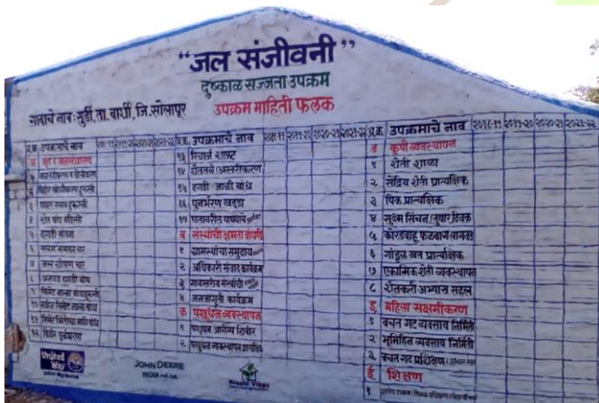
Wall painting of project details