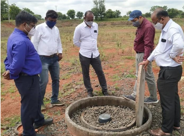
Recharge shaft for water security & conservation