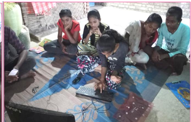
Digital literacy classes undertaken at home