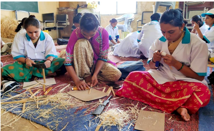
Bamboo based products as livelihood activity