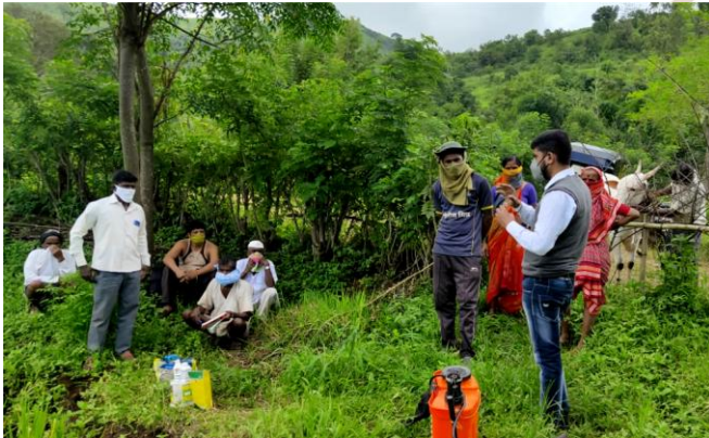
Farmers Field School