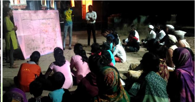
Collective discussion through PRA