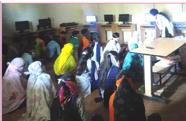
Digital literacy classes

As of today, Krushi Vikas has provided digital literacy trainings to more than 2000 beneficiaries in 8 centres and villages. During the FY 2020-21, COVID-19 restrictions prohibited classroom trainings however Krushi Vikas ensured that learning process continue unhindered by conducting classes at village clusters and through online mode.