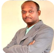
Chief Executive Officer