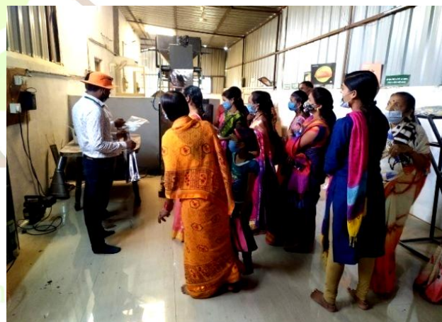
Exposure visit of women members