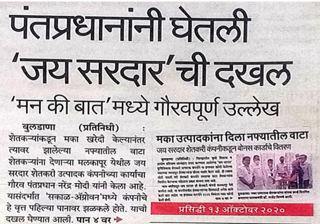
Mann Ki Baat & Bonus distribution