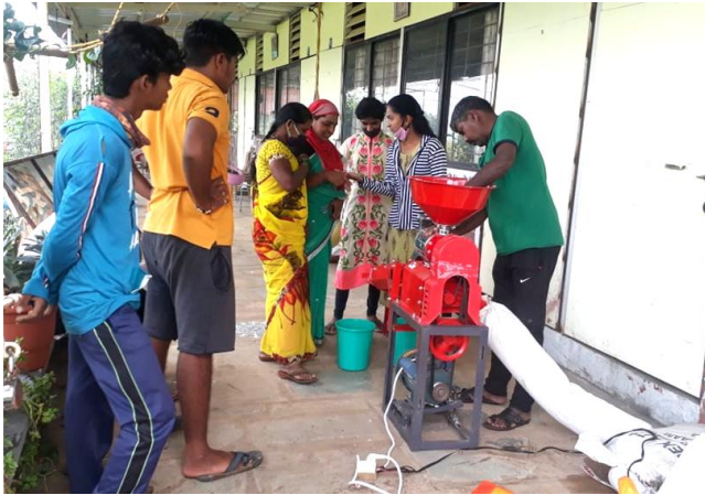
Mini-rice mill as a group livelihood activity