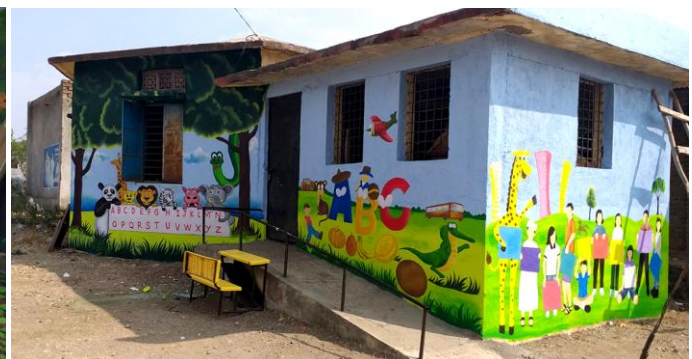
Renovation of school buildings