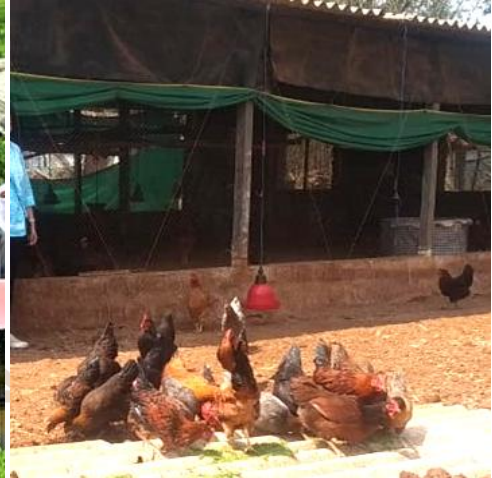
Group poultry unit