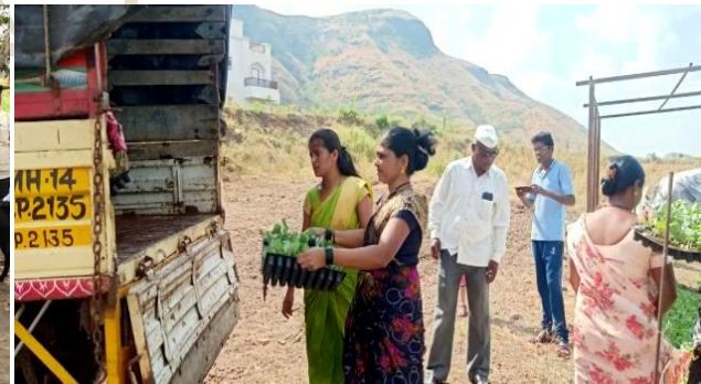
Women supplying saplings from their nursery