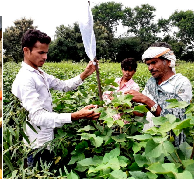
Pheromone traps demo