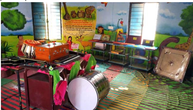
Games, sports and learning materials for schools

Education plays a crucial role in steady progress and development of the society. Krushi Vikas has intervened in infrastructure upgradation, sessions on effective learning methodologies, strengthening of various committees and provision of learning and games and sports materials thereby facilitating better learning outcomes. The schools are performing better in terms of infrastructure adequacy, students' participation in various school activities.