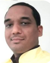
Director (FPO, Admin & Accounts)