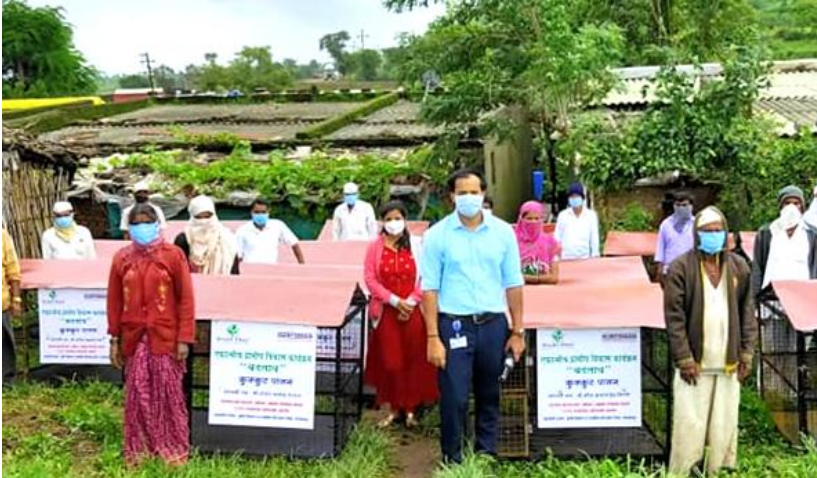
Poultry rearing as a livelihood activity

A decent sustainable livelihood is an indicator and indispensable part of quality living of an individual. Therefore, promotion of sustainable livelihoods forms a major component of Krushi Vikas. It promotes both farm and nonfarm livelihood activities consisting of good agricultural practices, crops diversification, agriculture and allied activities based micro-enterprises, value chain intervention and market linkages. It also promotes activities such as agri-business, mushroom cultivation, Vermi-composting, micro and mini enterprises, backyard poultry, bamboo production, dairy, backyard kitchen garden etc. especially for the vulnerable groups.