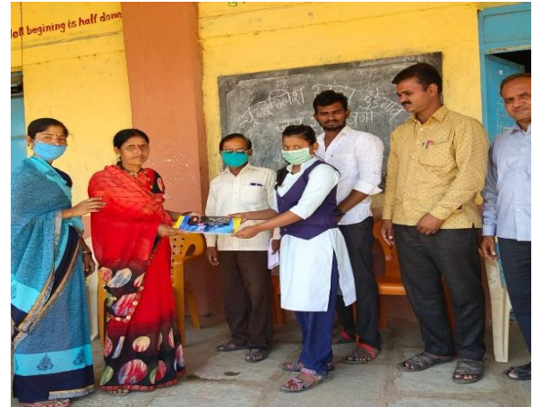
Encouragement of students

Through Krushi Vikas interventions, students who otherwise were deprived of learning levels, various games and sports in their respective schools have now access to various games, sports and learning materials. Additionally, with school infrastructure upgradation the teaching- learning activity between teachers and students is now being conducted in a more conducive environment that has been facilitating improved learning outcomes.