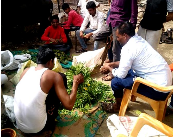
Preparation of dashpani