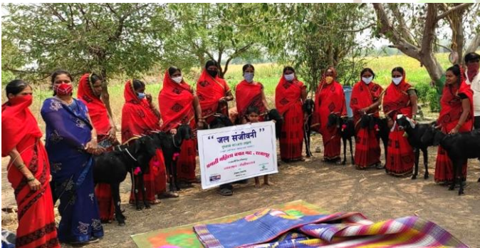
Goat rearing as a livelihood activity