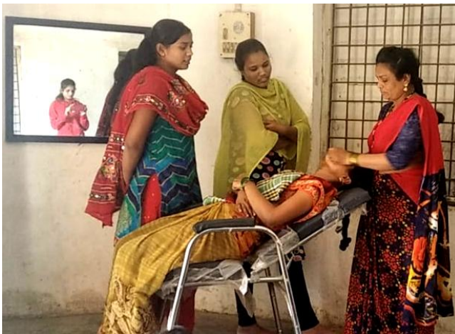
Beauty parlour as a livelihood activity