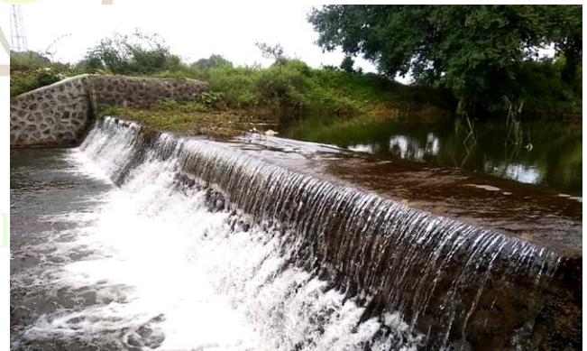
Check dam for water conservation and irrigation