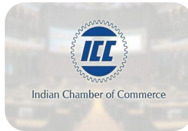
Special Jury Recognition Award by Indian Chamber of Commerce in Jan 2019