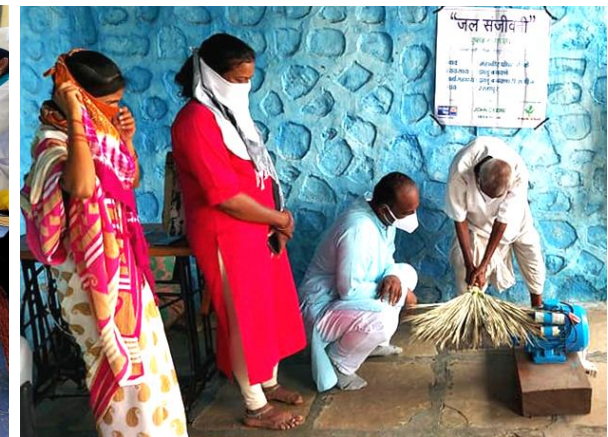
Broom making as a livelihood activity